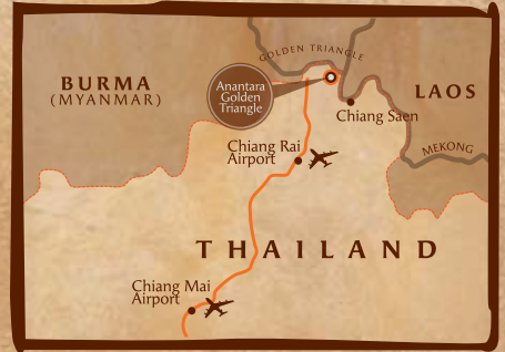
Anantara Golden Triangle sits at a crossroads of wildlife and civilisation.

Despite the increased access, however, the mystique of this place remains. The serpentine river divides the verdant hillsides into three countries, but the area itself hosts many more than three cultures, including those of several hill tribes. Anantara Golden Triangle's excellent location in the heart of the Thai portion of the region makes it an ideal place to begin exploring the rich heritage and natural beauty of this unforgettable corner of Southeast Asia.